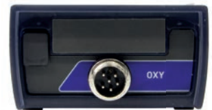
Connections on OXY 70 Vio