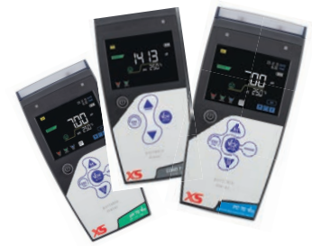
Conductivity meter and Multiparameter