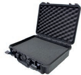
IP 67 case - optional cod. 50010972