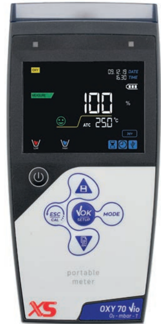
Only 6 buttons to easily manage all the functions of the instrument.