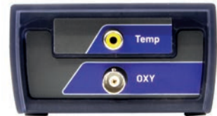
Connections on OXY 7 Vio

XS OXY 70 Vio model uses an optical sensor , available in two versions: cable length 2 m or 10 m .