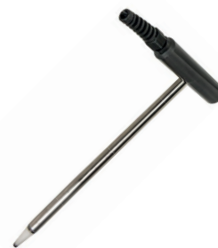
VPT SOIL for direct measures on soil cod: 50004082