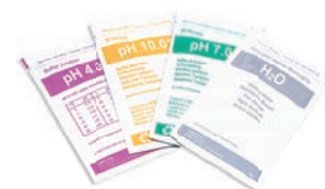
Buffer solutions Certified standard solution of pH, Conductivity and Redox. Different formats available.