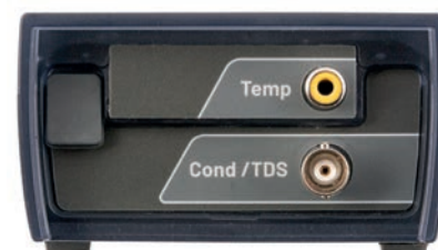
Connections on COND Vio