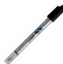
2301 T Conductivity cell, Temperature sensor integrated Cable 1 m Measuring range: 10 \mu S...200 mS cod: 50004002