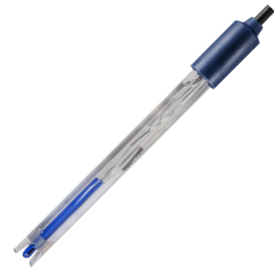
201 T DHS