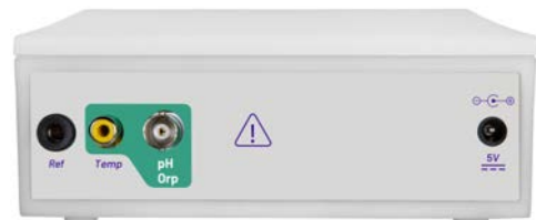
Connections pH 50 VioLab

The LED indicator allows you to keep always under control the state of the measurement