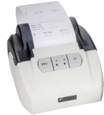
RS 232 printer