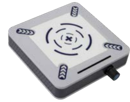
ST 10 magnetic stirrer