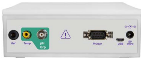
Connections pH 60 VioLab