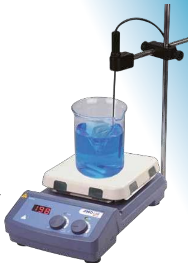
Stirrer M3-D with adjustable stand and PT 1000 probe