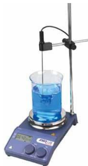
Stirrer M2-D Pro with adjustable stand and PT 1000 probe