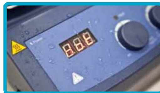
Splash proof front panel