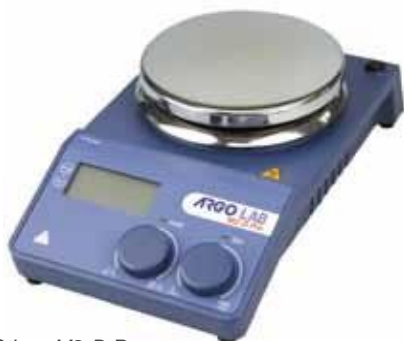
Stirrer M2-D Pro