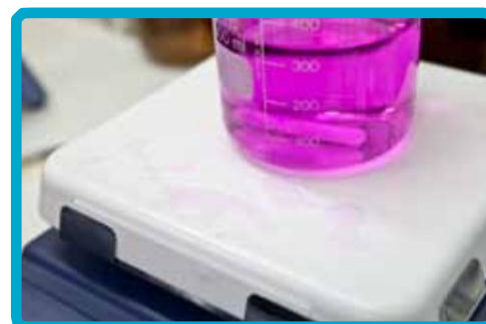
Glass ceramic hotplate with high chemical resistance